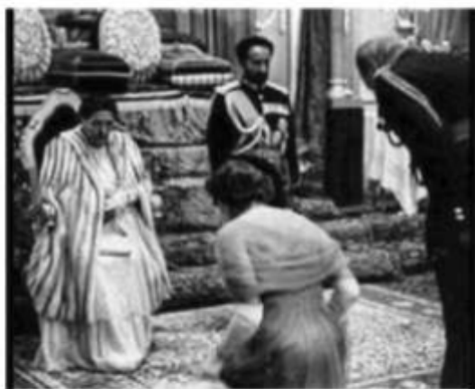
Rare photo of Queen Elizabeth II and Prince Phillip bowing before the real original African Royalty, Empress Menen Asfaw and her husband Emperor Ras Tafari Makonnen Woldemikael Haile Selassie I of Ethiopia...

Like most Ethiopians, his personal name Tafari is followed by that of his father Makonnen and rarely that of his grandfather Woldemikael. ... Haile Selassie's full title in office was "By the Conquering Lion of the Tribe of Judah, His Imperial Majesty Haile Selassie I, King of Kings of Ethiopia, Elect of God"